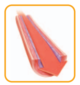
Healthy artery walls allow blood to flow freely.